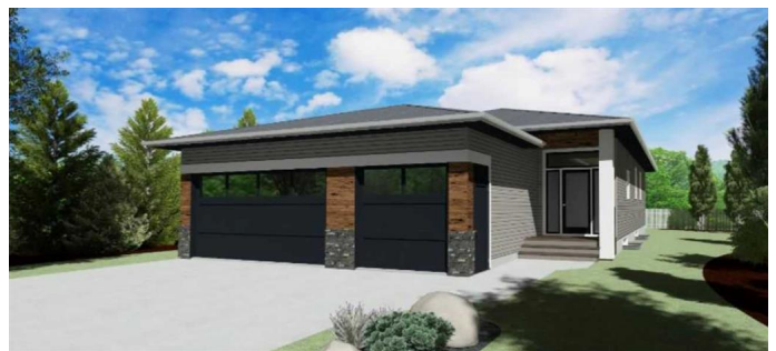
40 Thorkman Ave Main - 1389 sq.ft